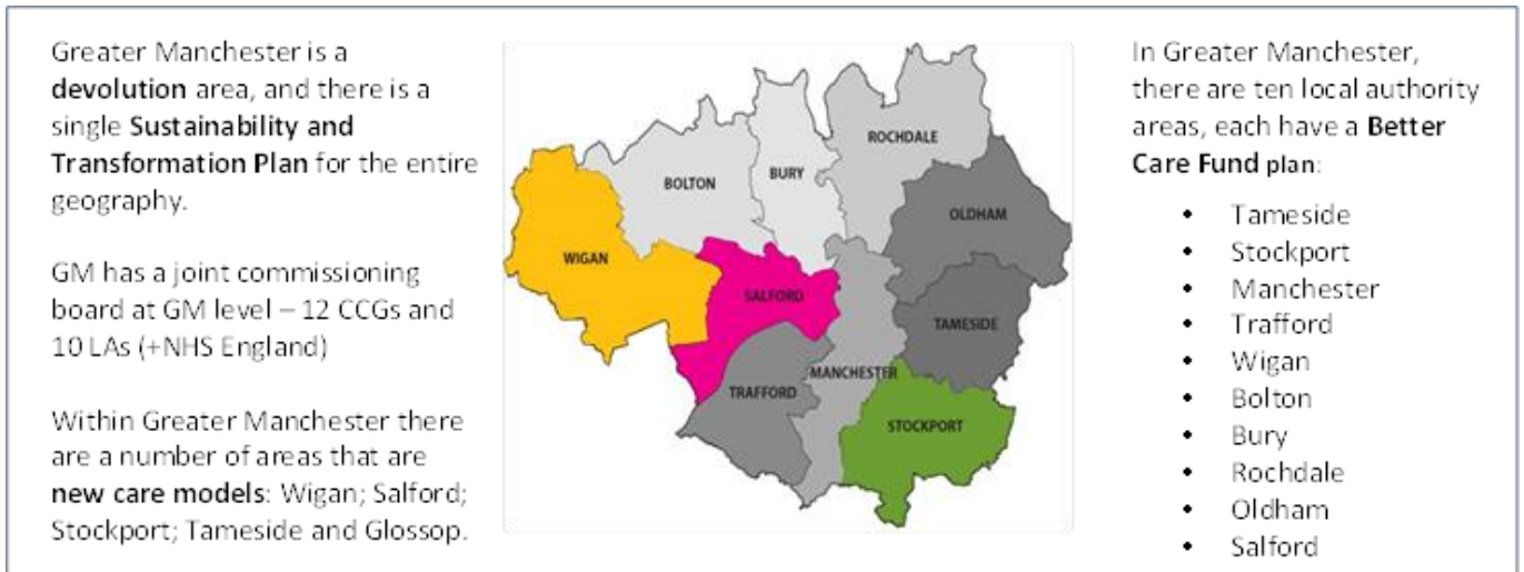
Figure 3 – Integration initiatives in Greater Manchester

There is a growing evidence base on the contribution that housing can make to good health and wellbeing. At a system level, poor housing costs the NHS at least £1.4bn per annum. And there are also costs to local government and social care. On an individual level, suitable housing can help people remain healthier, happier and independent for longer, and support them to perform the activities of daily living that are important to them – washing and dressing, preparing meals, staying in contact with friends and family.